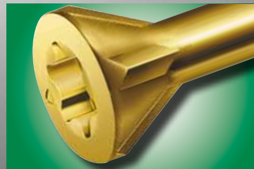
Small 60° milling head