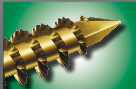
SPAX CUT point