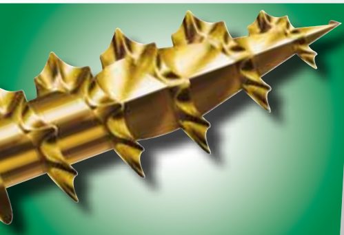
SPAX 4CUT point